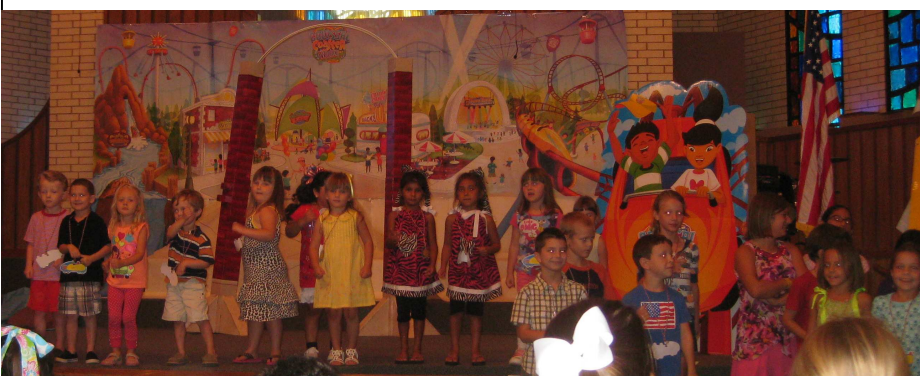
The classes sang for their families on Family Night at our Brady VBS: Colossal Coaster World.